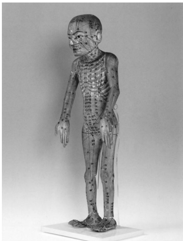
Figure 7. 'Saga prefecture Takeda family's Douningyo' height 80.0 × breadth of shoulder 17.0 cm.

pioneered new acupuncture. As a result, a new movement was set to reconstruct acupuncture, and in 1911 new rules for acupuncture and moxibustion clinics were established, which allowed acupuncture and moxibustion to operate as business, effective until 1947.