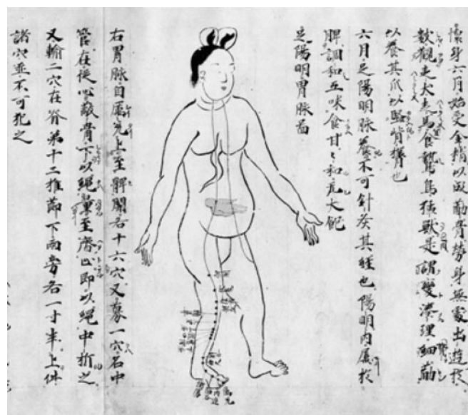
Figure 1. 'Ishinpo' (replica).

As soon as the Heian period began, exchange with the Tang dynasty (China) was activated, and aristocrats (doctors or well-educated people) who could travel to China brought high-grade information and current medical books to Japan. As a result, Tang medicine began to take root in Japan, until 894 when exchange with China stopped and Japanese physicians gradually reverted back to the original Japanese medicine.