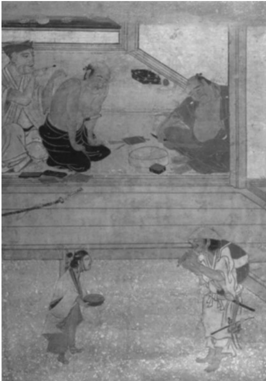
Figure 2. 'Old Picture of Workman (acupuncturist)', the early Edo period drawing replica 41 × 28.5cm.

was called the Civil Age. Dosan Manase considered the importance of meridian and acupoints for acupuncturists and doctors. At that time, the differing views concerning the location of acupoints used to be a topic of discussion. He recommended the book shi si jing fa fui , a technical book of meridian and acupoints. The importance of acupuncturists' learning about meridian and acupoints continues till present. Even after 400 years, textbooks of meridian and acupoints used at colleges in Japan are based on shi si jing fa fui . Dosan also opened a systematic medical school and it was presumed that the school emphasized on teaching herbal medicine, but acupuncture and moxibustion were also taught (8,9).